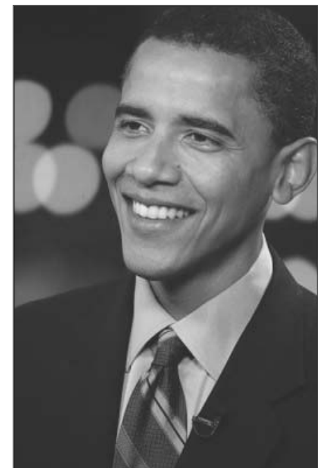
Barack Obama

The website says that the removal of our troops will be a responsible one, under the direction of military